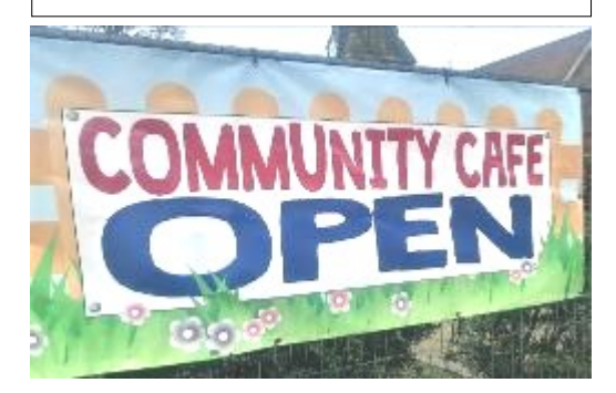
Open Tuesday to Friday 9am - 3pm & Saturdays when there is a Farmers' Market or other event.

Farmers' Market on Kings Heath Village Square Saturdays May 4th & June 1st 9.30am-4pm