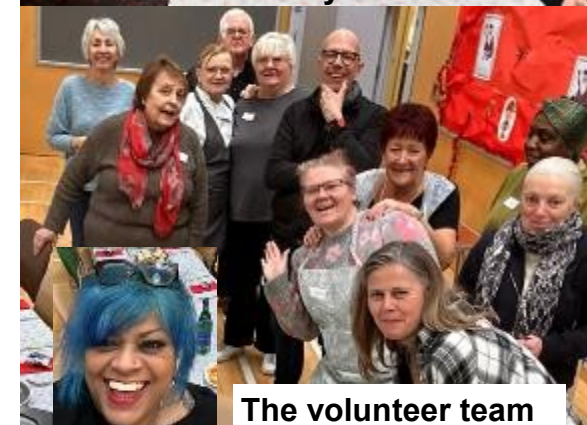
The volunteer team

Photos from the Sunday lunch on 7th January. These lunches are hosted by All Saints Community Catering, and partly funded by 'Help in Brum'.