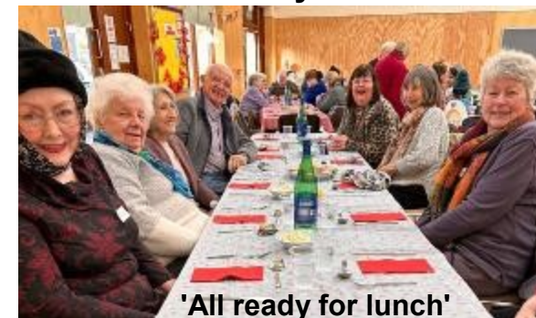
'All ready for lunch'