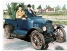
Laurel & Hardy In Big Business

Saturday 7th December All Saints Craft Fair In the Hall 10am—2pm