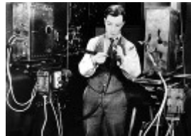
Buster Keaton In Sherlock JR