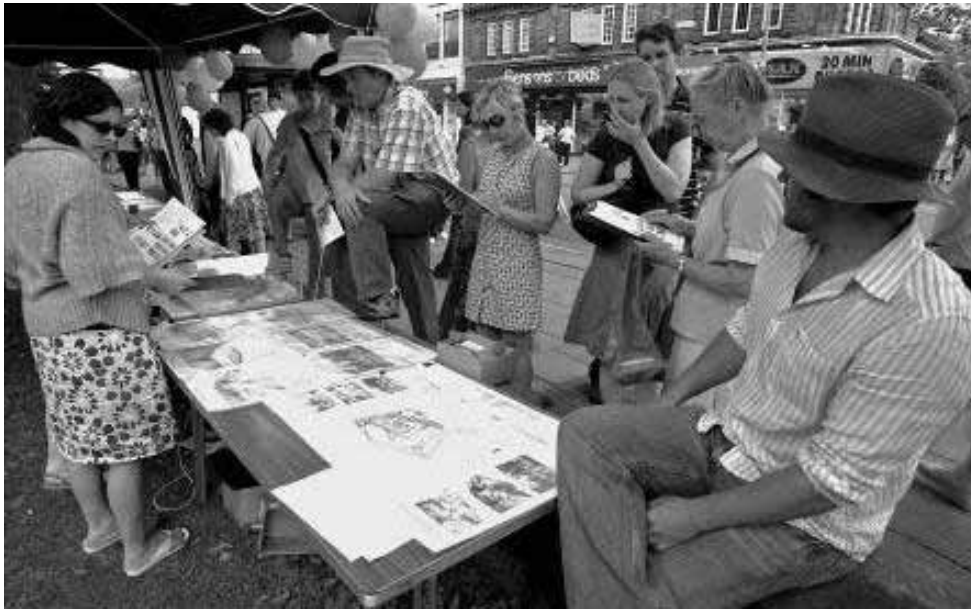
Village Square Consultation underway on the High Street 4 th July 2009

Results were obtained from 136 completed questionnaires and 80 opinion sheets. Here's a summary of the opinion sheet results; we'll include a summary of the questionnaire results and the latest proposals next month: