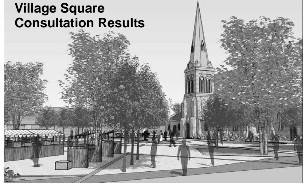
Architects drawing of the Village Square with the Farmers Market

“It gives a centre to the community, a focal point”