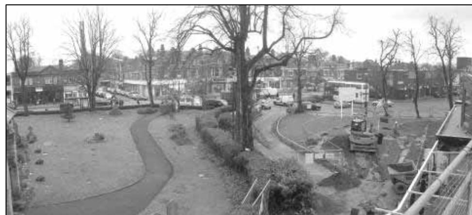
A 'Birds Eye' view of the site for the New Village Square

Do you have spare time on Wednesdays to support a worthwhile project ? The Lunch Club provides soup, sandwiches & a pudding for over 40 people each week. All of the food is prepared by volunteers during the morning from 10am. They then serve people & clear away by 2pm. The Healthy Living Project are looking for volunteer coordinators to assist in organising weekly sessions 1til 2pm If you are interested please ring telephone no 0121 443 4421