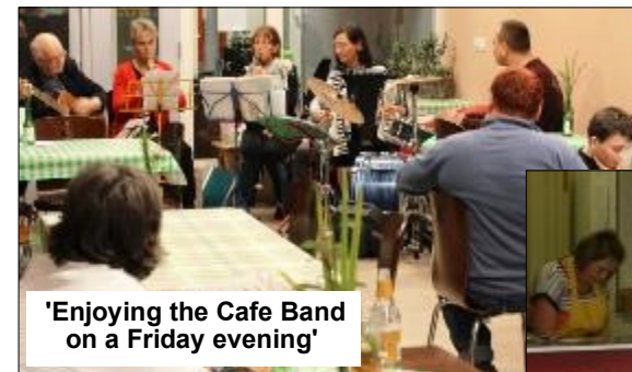
'Enjoying the Cafe Band on a Friday evening'